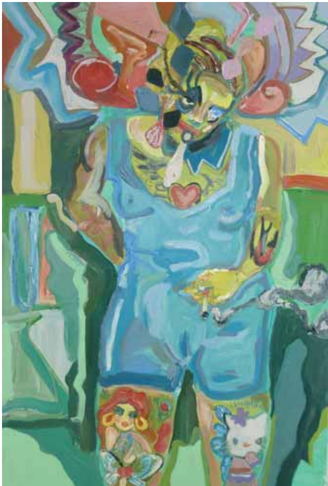
Sheila Rennick, Camel Night , 2011, Oil on canvas, 150 x 100 cm, Image courtesy of the artist.

Sheila Rennick's distinctive paintings show glimpses of a strange and distorted world, which exists in the artists' imagination. Dark humour and pathos infest each of her candy-coloured narratives, and wonderfully drawn figures, dogs, men and cats emerge from expertly rendered thick impasto oil paint. The characters in Rennick's paintings derived from photographs, stories and passing moments or events. She mixes reality and the everyday with imaginary elements - animals and people often work together to resolve something within the paintings. Rennick's work can be ironic and at other times it can be simple and direct with its intentions. Painted in thick brushstrokes in sweet pastels with shades of darkness, she works directly onto the canvas from collage and carefully selected imagery.