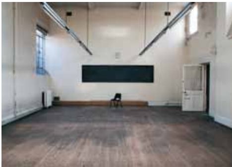
Dublin Contemporary Earlsfort Terrace Venue