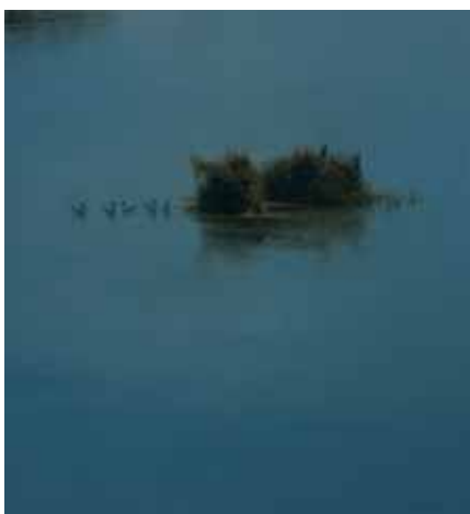
James English RHA, The Gulls Waiting , 2011, Oil on canvas, 41 x 38 cm, Image courtesy of the artist, Photography Gillian Buckley.