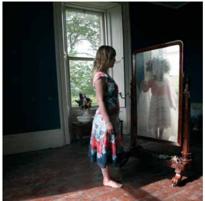
Martina Cleary, Memoria , 2011, Lambda print, 100 x 100 cm, Image courtesy of the artist.

Further information about this artist is available at www.martinacleary.com