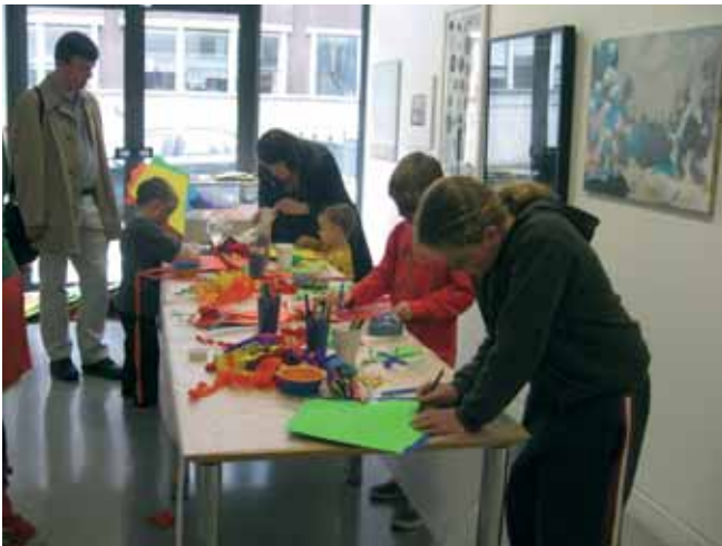
Childrens Kite making workshop at the RHA Summer Fête