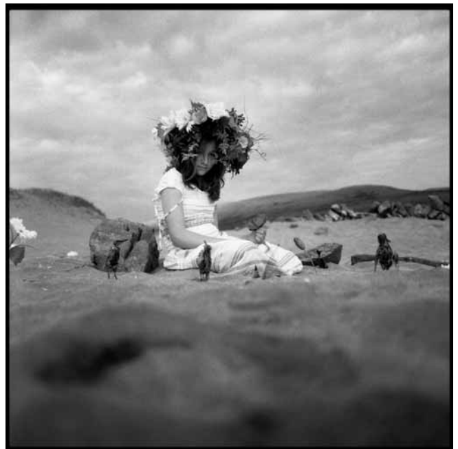
Martina Cleary, Premonition I , 2011, Giclee print, 40 x 40 cm, Image courtesy of the artist.