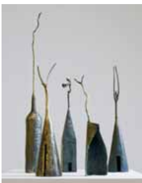
Eilis O'Connell RHA, Soul Houses , 2010, Cast bronze (unique), Dimensions Variable, image courtesy of the artist.