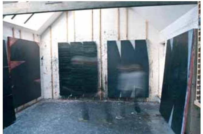
Charles Tyrrell studio, Photography Con Kelleher. Image ©Charles Tyrrell, 2011.

These new works are physical and robust. In many respects this work is sculptural, having more in common with the profound simplicity of Richard Serra's sculptures and their exploration of gravity than with the issues of abstract painting. Shapes are compressed, fractured, fissured and faulted as if Tyrrell is taking the forming of the earth itself as his subject. More tectonic than topographic Tyrrell's paintings speak of the essentiality of paint and existence, of fact and of metaphor with equal passion.