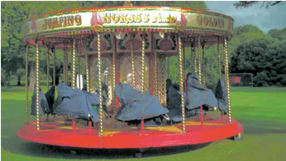
James Merrigan, night-knight , 2011, Video still, 46 seconds, Image courtesy of the artist.

James Merrigan insets video, audio and text in built environments, that play with the darker aspects of society. He will install a scale-specific installation, entitled night-knight , at the RHA, that will endeavor to challenge perceptions of time and place, with base materials found at the currently static and uncanny construction site.