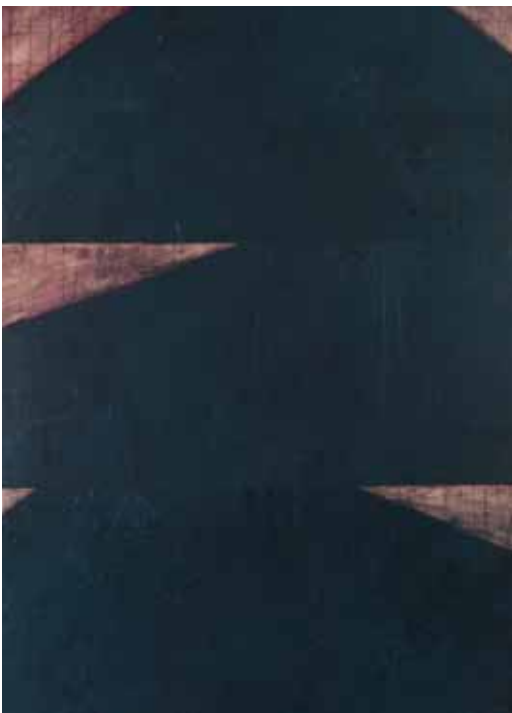
Charles Tyrrell, C7.10, 2010, Oil on canvas, 210 x 150cm, Image courtesy of the artist, Photography Con Kelleher.

Please note that the work on show in the Atrium will finish on 30 October. A full colour catalogue will accompany this exhibition. www.charlestyrrell.ie