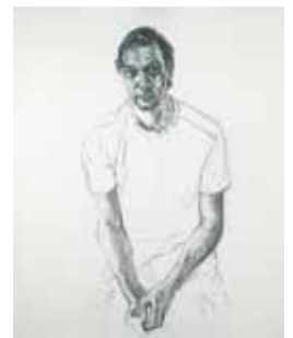
Alan Daly, Johnny , 2011, Charcoal on paper, 120 x 100 cm, Image courtesy of the artist