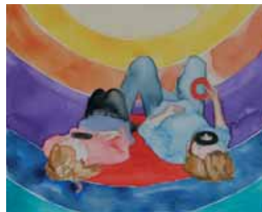
Orla Whelan, The importance of circles 2 , 2011, Watercolour on canvas, 20 x 25 cm, Image courtesy of the artist.

Alan Daly's practice is defined by a commitment to live observation within the genre of portraiture. He is striving to capture the energy of the encounter with the subject and to record the intensity of looking. Using charcoal to obtain a raw immediacy, his drawings on paper are completed in one vigorous session. Daly studied Fine Art Painting at D.I.T. He has previously held solo exhibitions at Draiocht Arts Centre, Talbot Gallery and the Belltable Arts Centre in Limerick. www.alandaly.org