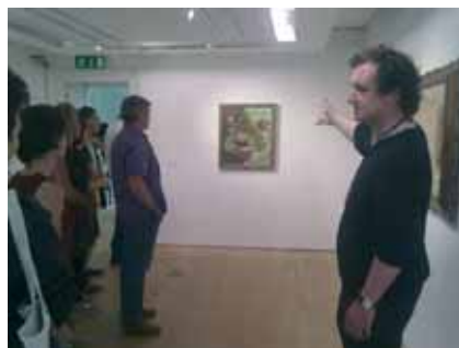
Tour of Kahlo Rivera exhibition in IMMA