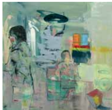
Diana Copperwhite ARHA, Evidence , 2011, Oil on canvas, Image courtesy of the artist