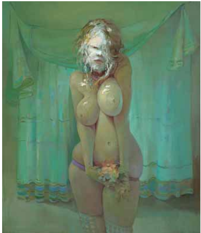
Lisa Yuskavage, PieFace , 2008, Oil on linen, 121.9 x 102.2 cm, Courtesy the artist and David Zwirner, New York.

Emerging artists will be shown alongside established figures, creating a dialogue between the past and present of contemporary art, which will be fleshed out further in the architectural treatment of the show spaces. Much of the original character of these spaces, as well as the traces of their past use, will be retained, enmeshing both the history of the building and its current use, while providing a platform for artists and audience to engage with this ambitious exhibition.