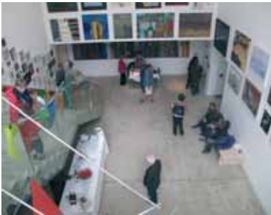
Bunting in the Atrium