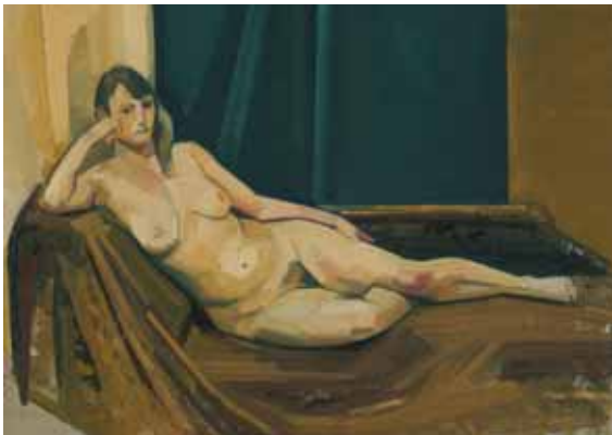
James Hanley RHA, Aine , 2011, Oil on canvas