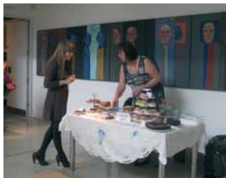
RHA cake stand, always an early sell out!