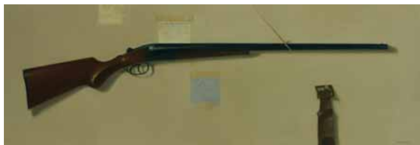
James English RHA, Sporting Piece , 2011, Oil on canvas, 46 x 152 cm

English can accurately be described as an intimist. He does not paint large, and while watercolours may be made plein-air, his practice is based in the studio. English is passionately interested in nature, particularly ornithology and landscape. In the latter, it is not the dramatic or sweeping topography that captivates him, rather the dynamic details of a landscape - the play of light in branches, moments of reflection, quiet habitat. This investigation of light is further pressed in his still lifes. Reflective props are employed to catch the studio window or the electric light bulb. Sfumato and atmospheric, English's still lifes often juxtaposed an inanimate object with something from nature - a feather, a reed, a flower. These momento mori add a poignancy to his compositions.