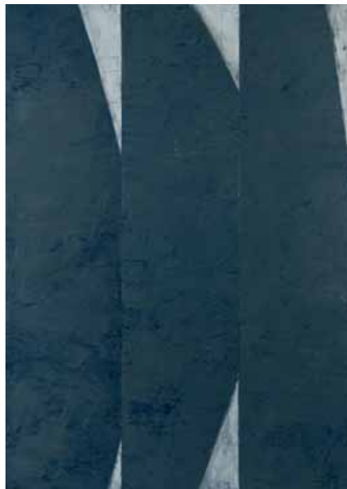
Charles Tyrrell, C1.11, 2011, Oil on canvas, 210 x 150cm, Image courtesy of the artist, Photography Con Kelleher.