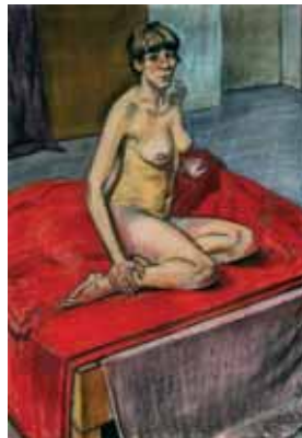
Mick O'Dea RHA, Female Nude Posing , image courtesy of the artist