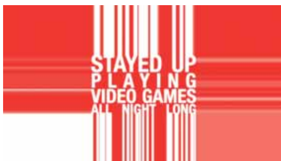
Alan Butler, Still (7) from Content , 2011, 5 min 40 sec, HD Video

Alan Butler's work makes use of appropriation and remixes cultural artifacts and icons by taking items that possess specific lineages and combines them with disparate elements in order to create works that represent other ideas and 'truths'. This results in works that criticise realities which are constructed through the semiotics and narratives created by our consumption of information. His exhibitions often take the form of multi-artwork installations, which describe the consumption and the consequential misunderstanding of information across borders and different cultures. A post-modern cynicism is often present in the works, which also aim to be humorous in their depiction of the spectacle in modern society. While an underlying philosophical and conceptual groundwork dictate their formation, references to ubiquitous cultural, political and economic circumstances permits accessibility to the works.